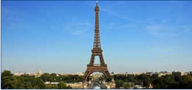
RPM Belgium applied the floors of the Eiffel Tower.