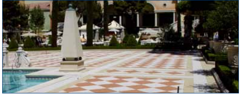
RPM Belgium applied many Pool Decks in Las Vegas.